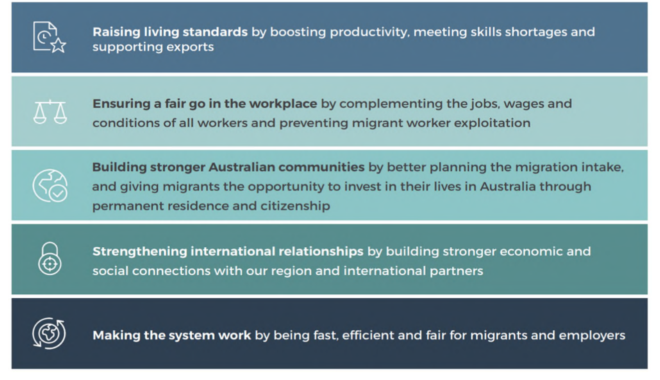
Figure 1: The five core objectives that underpin Australia's migration system

Permanent migration is also at the centre of building a stronger Australian community, which recognises the important contributions that permanent migrants make in Australia. Restoring permanent residence to the heart of our migration system will help build a more vibrant, modern and multicultural Australia.